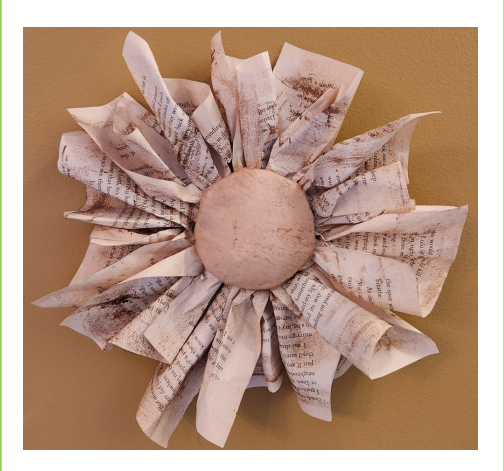
All supplies provided. Must RSVP!

Tuesday, Apr. 1st 10:00 Rustic Sunflower