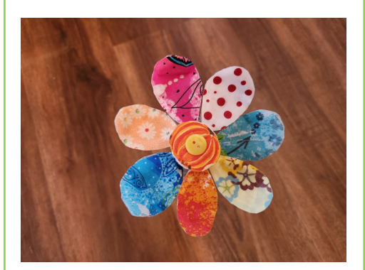
All supplies provided. Must RSVP!

Tuesday, Apr. 1st 10:00 Rustic Sunflower