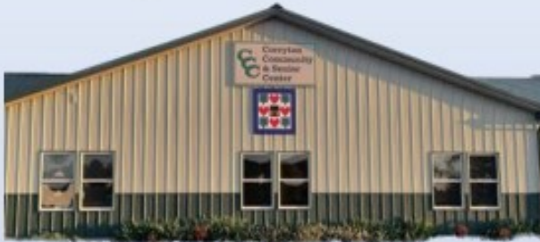
Corryton Senior Center