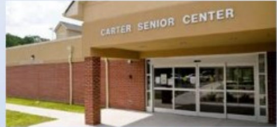
Carter Senior Center