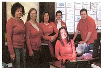
.Deputy Clerks in the Old Courthouse wear red for the American Heart Association