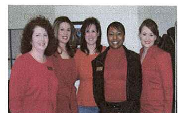
Ladies in the Business Tax office (OCH) support the Heart Association on "Wear Red Day", February 6.